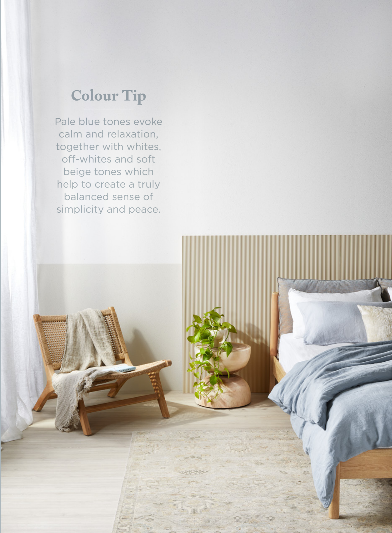
Lower wall, texture and top coat Watty GranolImpact in 'Driftwood'. Upper wall, texture and top coat Watty GranolImpact in 'Invisibility Cloak'. Leaning wall panel, Watty I.D Advanced in 'Vitesse'.

Pale blue tones evoke calm and relaxation, together with whites, off-whites and soft beige tones which help to create a truly balanced sense of simplicity and peace.