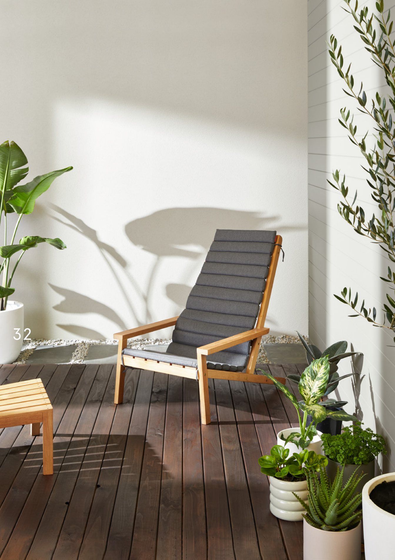
Rear wall, texture Watty! GranoMarble, top coat Watty! GranoShield in 'Billy the Kid'. Right wall, VJ board, Watty! Solagard in 'Shelter Cove'. Timber deck, Watty! Weathergard Decking Stain in 'Bark'.